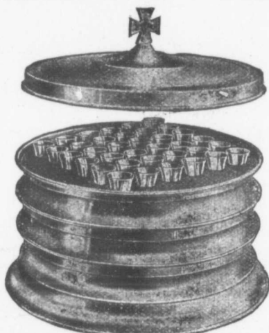
The TRAYS STACKED—Showing the interlocking advantage and their imposing and beautiful appearance on the Communion table.

FOR SANITARY REASONS a large and increasing number of congregations are adopting the Individual Communion Service.