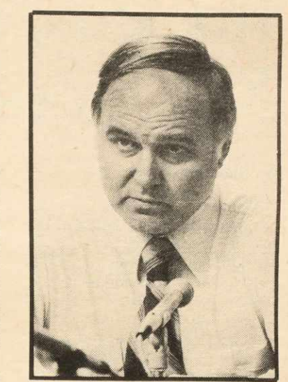
Author Michael Novak

The other weakness of the book lies in Novak's naive belief in "democratic capitalism". Novak's model—one of cultural, economic and political pluralism—has never existed and never can, if only because industrial capitalism leads to monopolies and oligopolies, which in turn