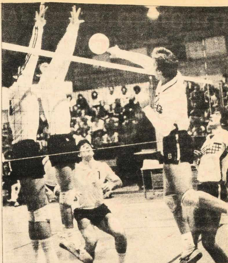
Penn State proved a touch too good for the Tigers in the gold match at last weekend's volleyball classic. The third-ranked American team added extra drama to an impressive tournament.

Next weekend the Tigers host the Dalhousie Classic Swim Meet at Dalplex with age group teams from all over Nova Scotia