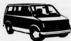
GMC Safari Passenger Van