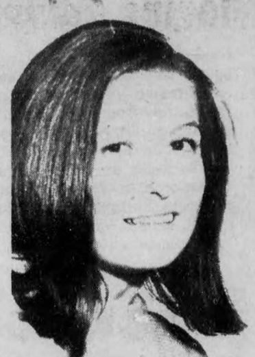
II This one hundred and nineteen pounds of pure Bus. Admin. comes across as a girl with definite ideas who eventually wants to be a lawyer. Not that the other members of the bar could keep their minds on their cases.