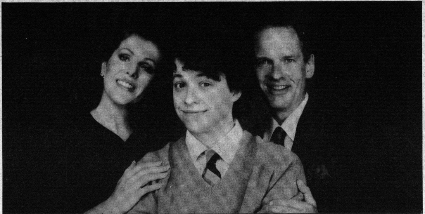
A screwball comedy of rebel kid vs mean parents

Then, on a shopping trip, Morgan meets Emily, a non-conformist, independent teen-