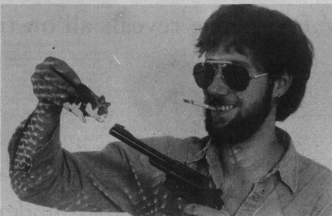
Look at this poor unfortunate hamster being mercilessly oppressed. Unfortunately our society chooses to ignore the plight of our furry friends but that doesn't mean we will. Power to the hamster!