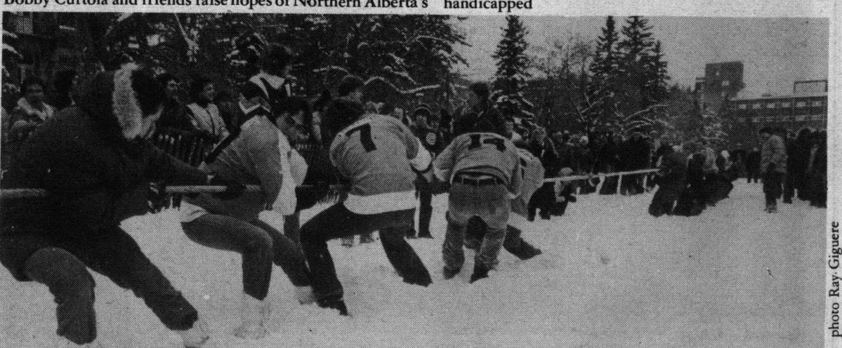
...while they frolicked in the snow