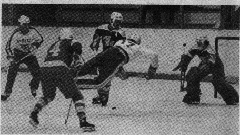
Bears blow chances like Mt. St. Helens erupts