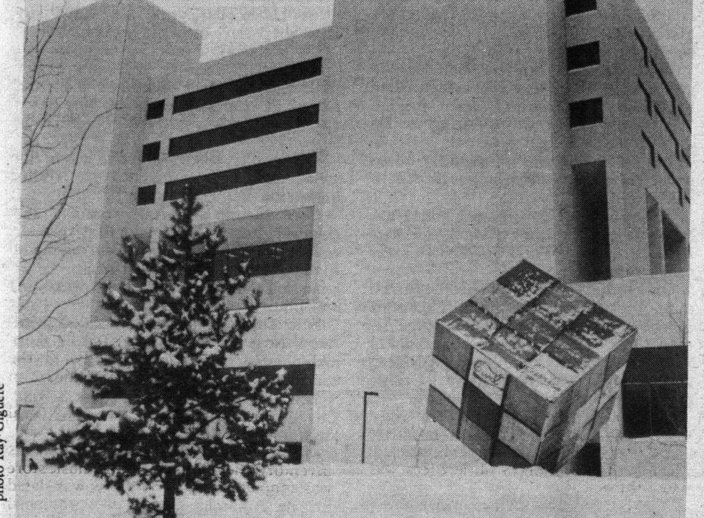
Invasion of the Rubik's Cube?