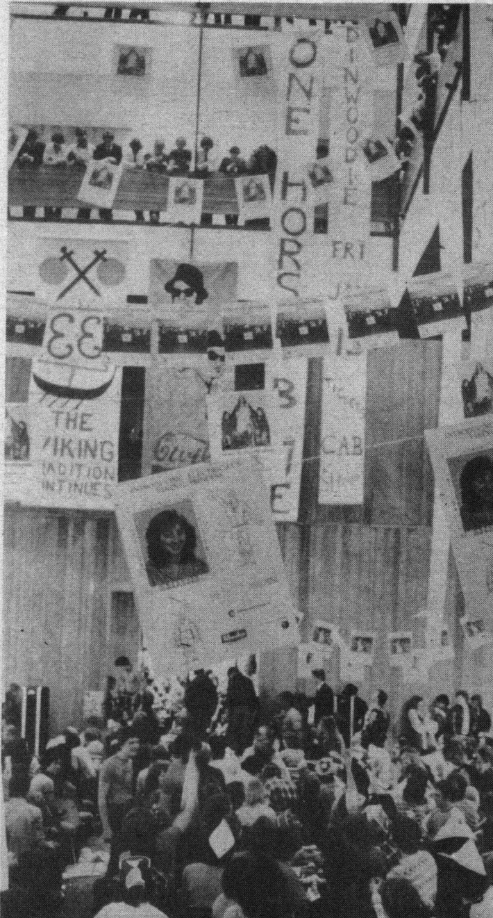
Engineering Week rallied for support