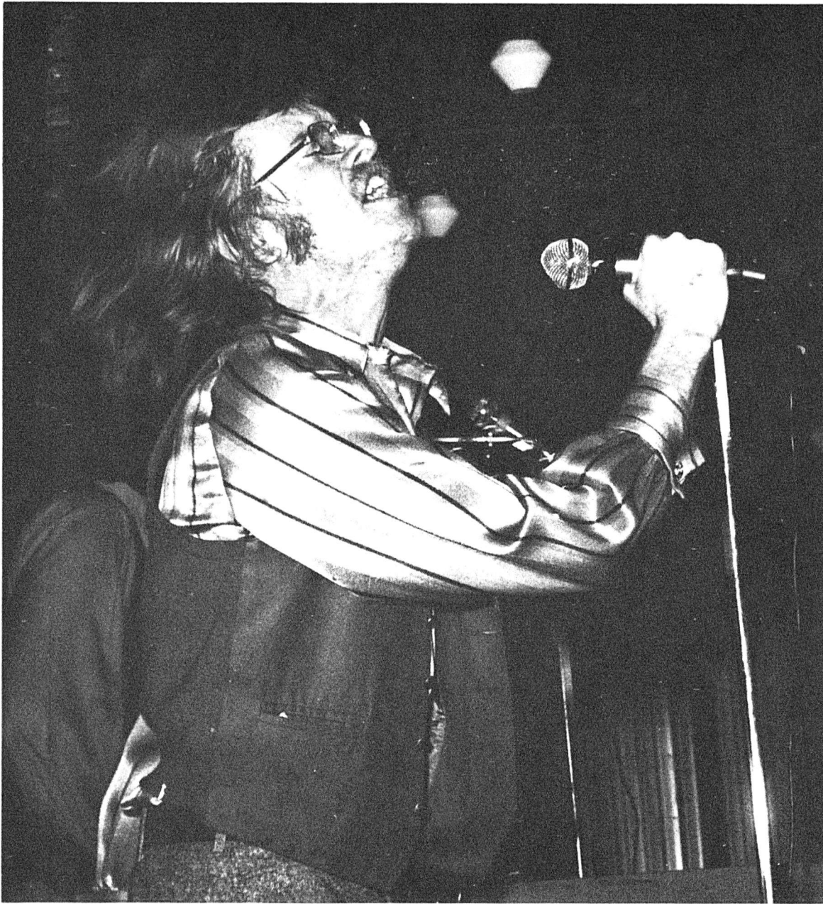
POLITICAL ROCK SHOUTS OUT ... a song for all the seasons of your mind