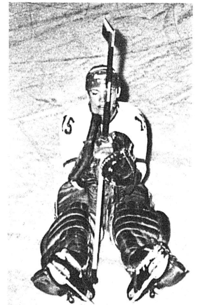
O ME, OH MY ... I missed again