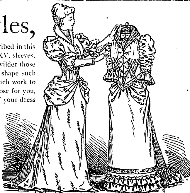
The Pattern on the Lady is Ladies' Costume No. 4112, price 1s. 8d. or 40 cents. The Bazar Form shows with what ease a costume can be arranged upon it.

EITHER STYLE OF FORM SENT TO ANY ADDRESS ON RECEIPT OF PRICE.