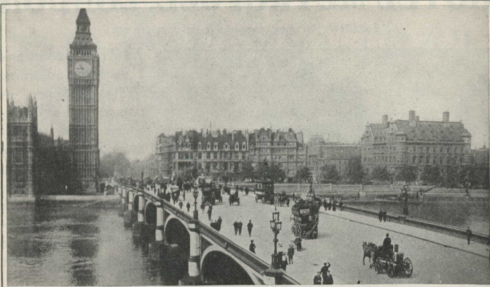
Westminster Bridge, London, England.