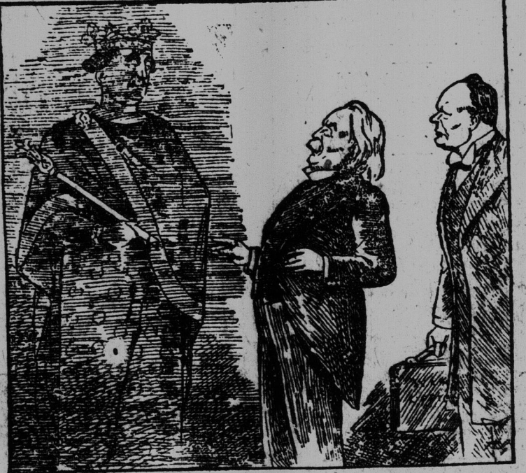
Shade of Henry II: "Sending troops to Ireland, are you? That's what I began to do seven hundred and fifty years ago. You don't seem to have got much 'for'ader' since I left!"—Westminster Gazette.