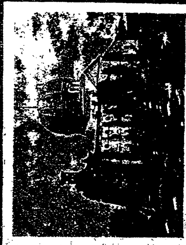
LA LOMA CHURCH.