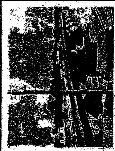
BRIDGE OF SPAIN.