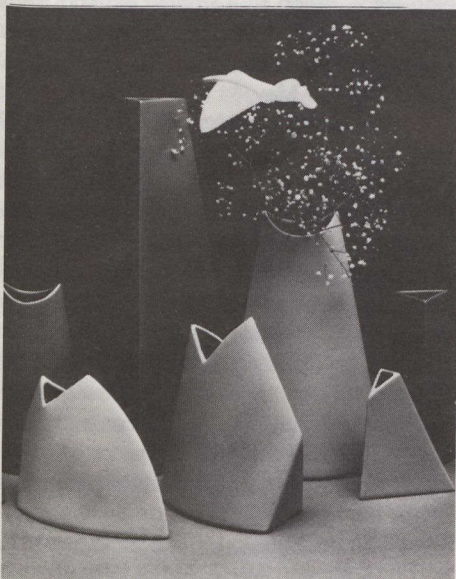
Accessories by Evangeline are made to complement contemporary furniture.

In Canada, the innovative KD concept was introduced some ten years ago and the industry has already captured 5 per cent of the Canadian furniture market. It is expected to increase its share to 20 per cent over the next decade.