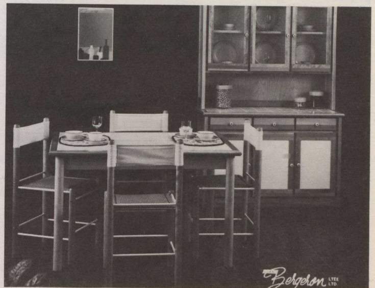
Jean Bergeron's Maskit collection in kiln-dried, solid maple has a contemporary styling to suit any room or lifestyle.