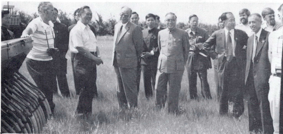
Chinese delegation visits a farm in Regina, Saskatchewan.

cial reception and dinner, given by Saskatchewan Premier Allan Blakeney to honour the delegation. Later, the guests stopped at a cattle ranch, a farm where they lunched with a family, a potash mine, and then they spent a Sunday at Lac La Ronge, fishing and relaxing at a private lodge, before travelling to Saskatoon to tour the city and visit the University of Saskatchewan.