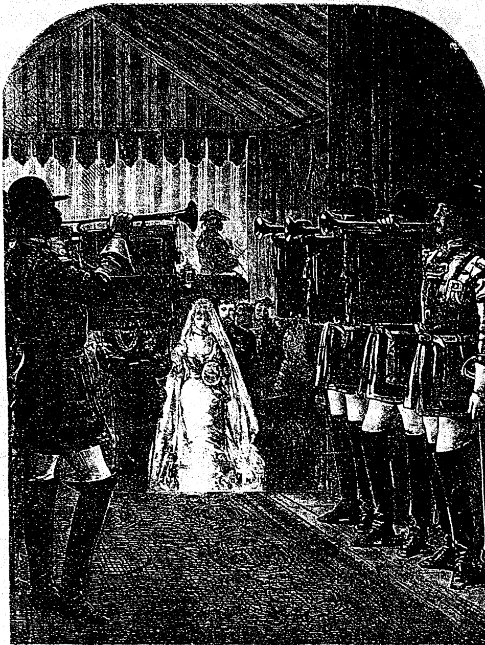
MARRIAGE OF H. R. H. THE DUKE OF CONNAUGHT. STATE TRUMPETERS ANNOUNCING THE BRIDE.