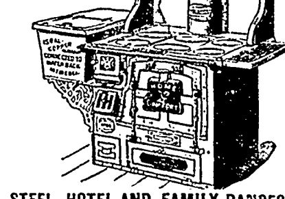
STEEL, HOTEL AND FAMILY RANGES.

SILVER MEDAL Toronto Exposition, Toronto, Canada, 1895. ABOVE HONORS WERE RECEIVED BY