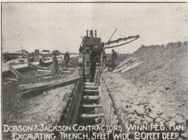
DOBSON & JACKSON CONTRACTORS, WINNIPEG, MAN. EXCAVATING TRENCH, 5 FEET WIDE, 20 FEET DEEP.

is guaranteed to work most economically and satisfactorily in any kind of soil (except rock), cutting any width from 28 to 78 inches and any depth to 20 feet, with one set of buckets, no change of parts.