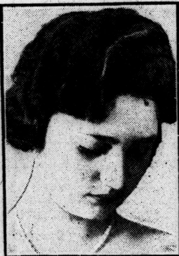
Princess Astrid of Sweden, third daughter of Prince Karl, in her confirmation robes.