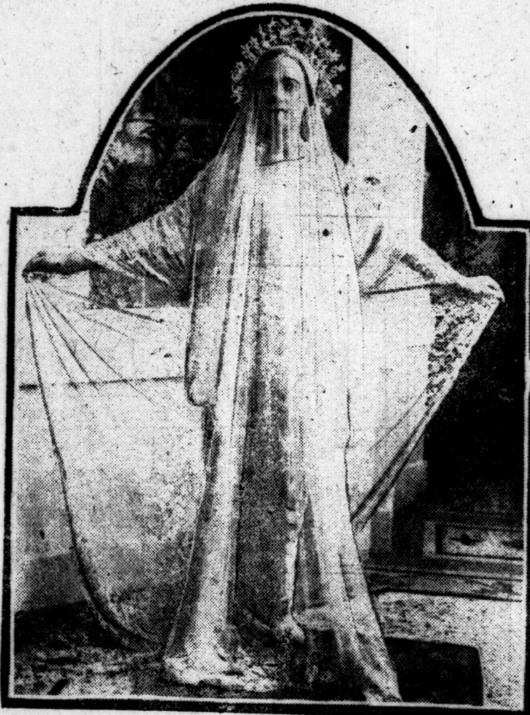
A weird wedding dress exhibited in London.