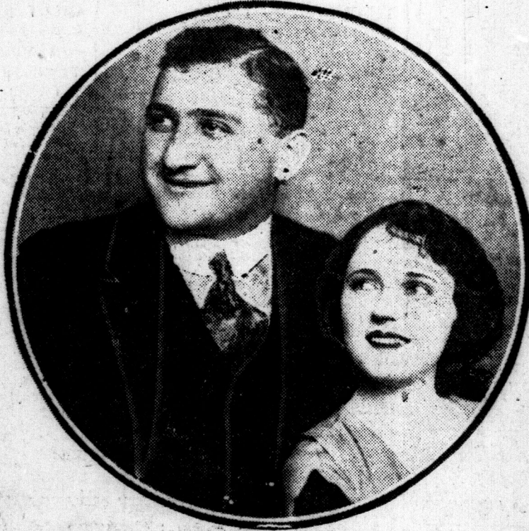
Carmel Myers, noted film beauty, and her husband, have decided to separate.