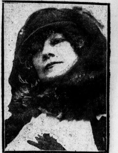
Mme. Georgette Leblanc, former wife of Maurice Maeterlinck.