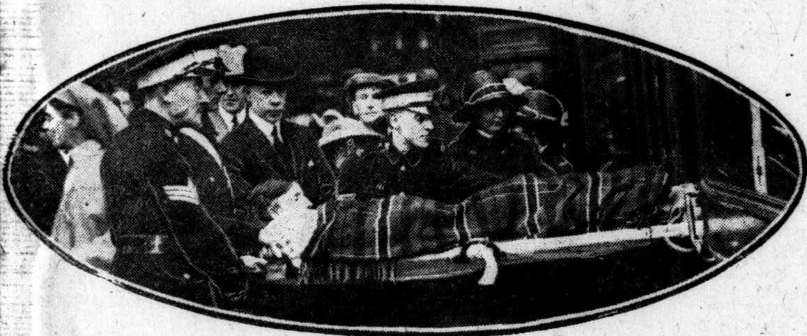
British invalids leave on a pilgrimage to Lourdes.