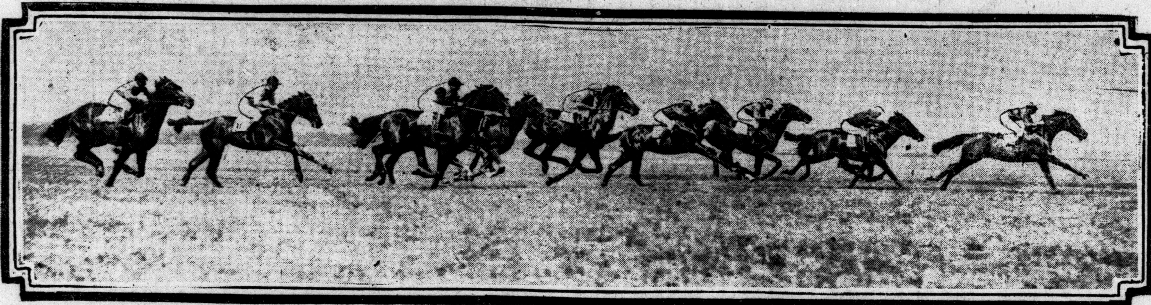
Little Cis F. leading the field in the May stakes, Newmarket, England. She was never headed.