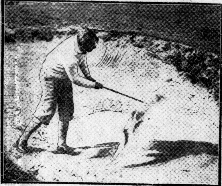
Jesse Sweetser, U. S. amateur golf champion, bunkered in the English amateur title tournament at Deal. He lost.