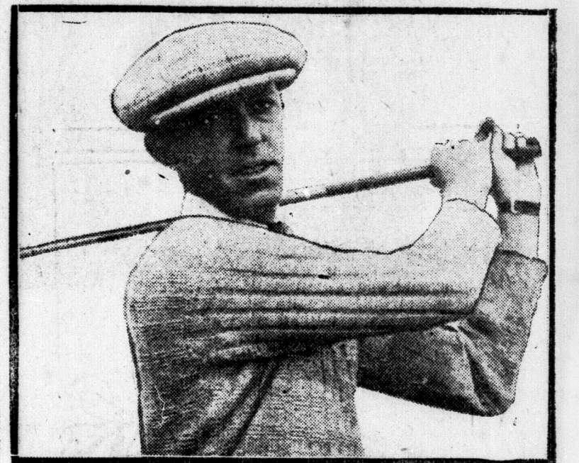
Francis Ouimet, driving at Deal.