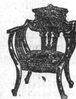
Arm Chairs in Wicker, not exactly like this cut. $13.50.