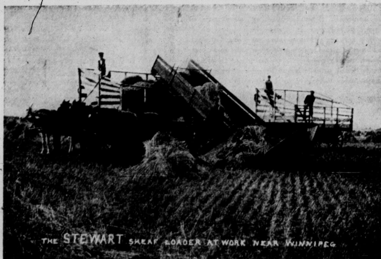
THE STEWART SHEAF LOADER AT WORK NEAR WINNIPEG