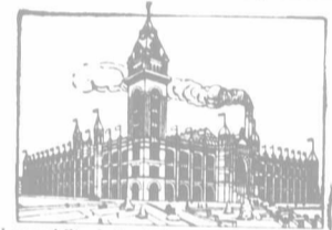
Largest Stock Food Factory in the World Capital Paid in, $2,000,000 775,000 Feet of Space in Our New Factory. Contains Over 16 Acres of Space.

Address At Once.... INTERNATIONAL STOCK FOOD CO., MINNEAPOLIS, MINN., U. S. A. TORONTO, CANADA.