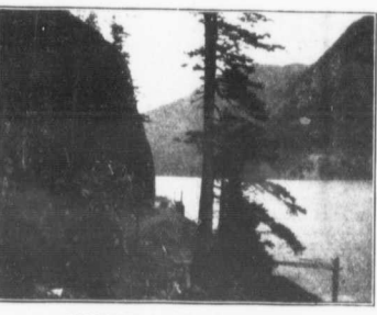
CAMERON LAKE, ALBERNI BC