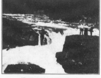
STAMP FALLS, ALBERNI, B.C.

XIII: Is systematic giving a necessary or optional part of Christian service?