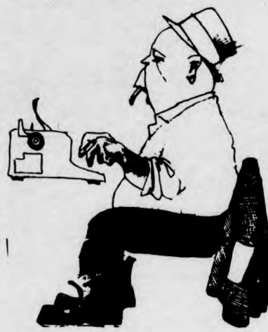
Excellent discussion and exposé of York BOG, re: Inco, Noranda, etc.

I would suggest more follow-ups or reports of the outcome of key stories such as "Budget Cut", "Harbinger - Hayden" struggle, "BOG expose".