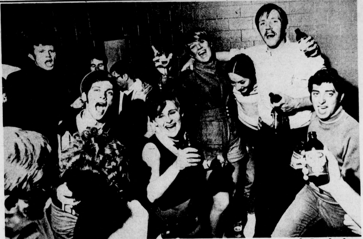
A beer commercial that didn't make it? Not really, just the BOGS caught au naturel in Green Bush Inn.

3101 BATHURST ST., SUITE 601 TORONTO 19, ONTARIO TELEPHONE 782-1155