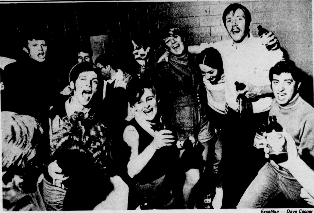
A beer commercial that didn't make it? Not really, just the BOGS caught au naturel in Green Bush Inn.

3101 BATHURST ST., SUITE 601 TORONTO 19, ONTARIO TELEPHONE 782-1155