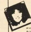
Andrea Martin Actress and Unicef Volunteer