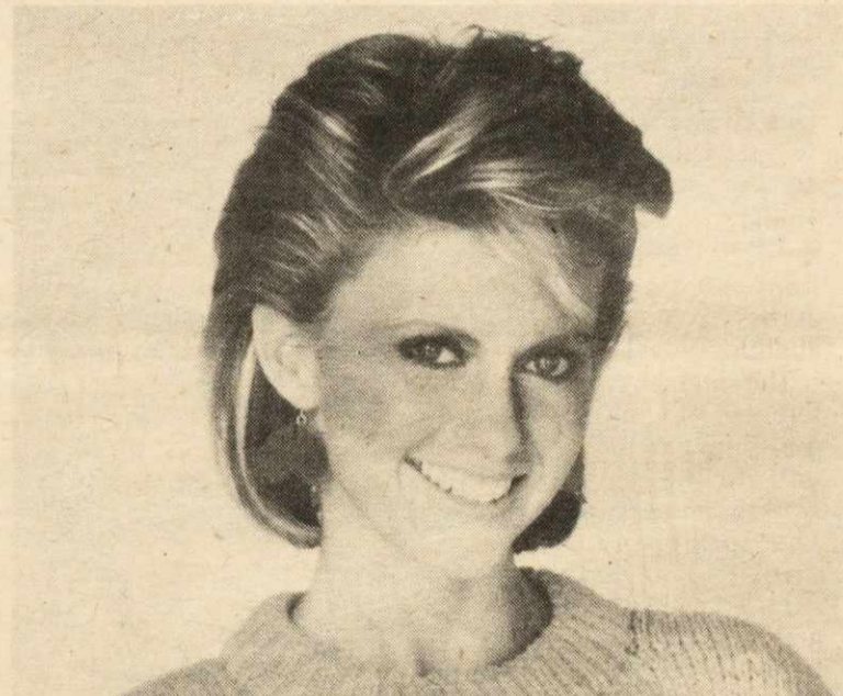
Olivia Newton-John is one of over 100 entertainers Dalhousie is boycotting for performing in South Africa.