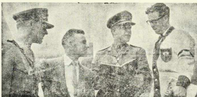
THE CANADIAN OFFICERS' TRAINING CORPS —University undergraduates may obtain a commission by training during their spare time and summer holidays. The student who trains under this plan is paid for his actual training time and is not obligated for full-time service after graduation.