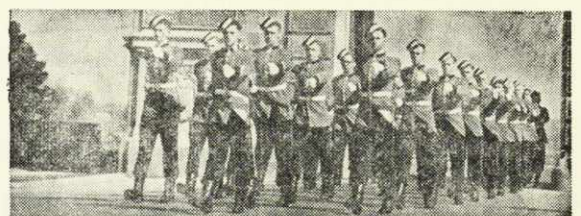
THE REGULAR OFFICER TRAINING PLAN —This is a tri-Service Plan wherein high school graduates receive advanced education and leadership training at one of the Canadian Service Colleges or a university to become officers in the Royal Canadian Navy, the Canadian Army or the Royal Canadian Air Force.