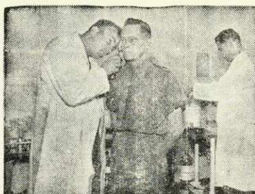
SUBSIDIZATION FOR PROFESSIONAL TRAINING —There are tri-Service plans wherein university students in medicine or dentistry can be subsidized during their course and become commissioned Doctors or Dentists in the Canadian Armed Forces.

Here are four interesting and rewarding plans for young men interested in a career as a commissioned officer in the Canadian Army: