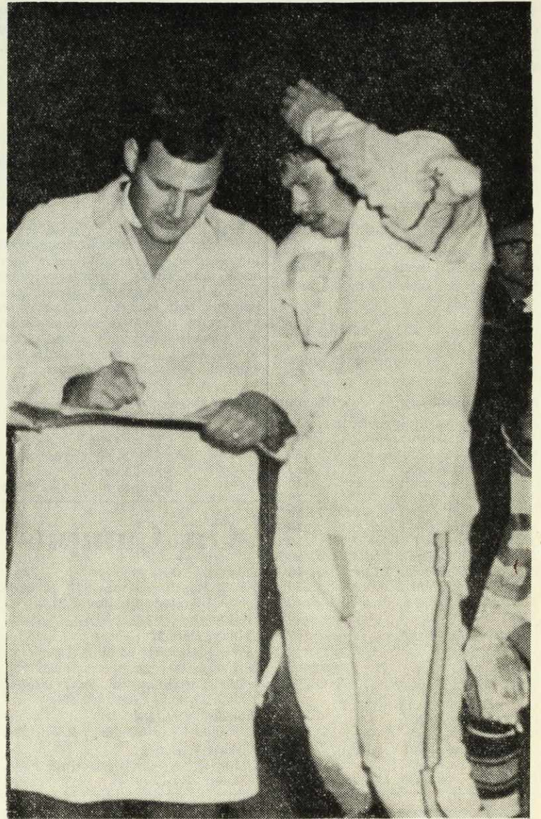
DUH... WHADYA SAY COACH?

Dalhousie suffered no serious injuries during the contest and were rated in good shape for this Saturday's important bout with St. F.X.