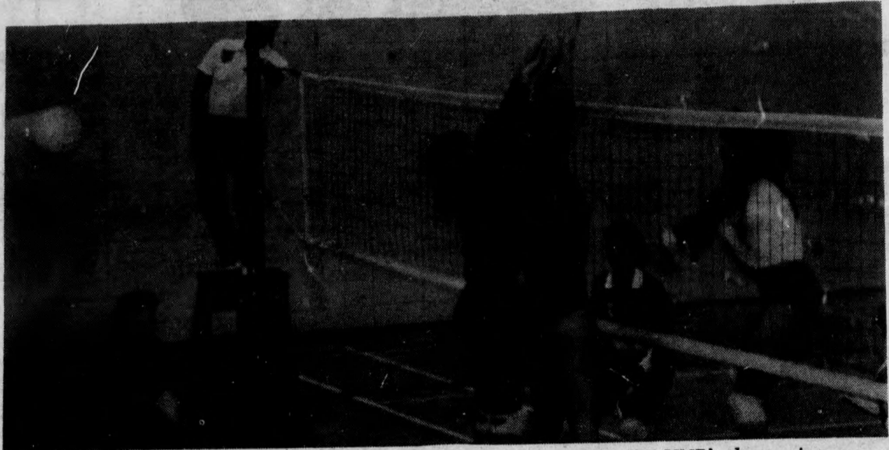
A Red spikes the ball past defending blockers during one of UNB's three wins.

The Reds have a week's preparation to work on team cohesion before regular season play begins. They take to the court next Saturday (November 14) for a 9:00 pm encounter with Acadia in the L.B. Gym. They'll host the same Acadia team the following Sunday for a 1:00 pm start.