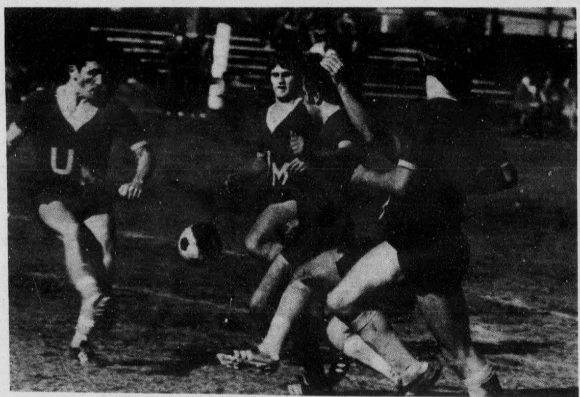
After a 4-1 victory against University of Maine, Presque Isle, the Red Shirts look like a threat to win the AUSA title.