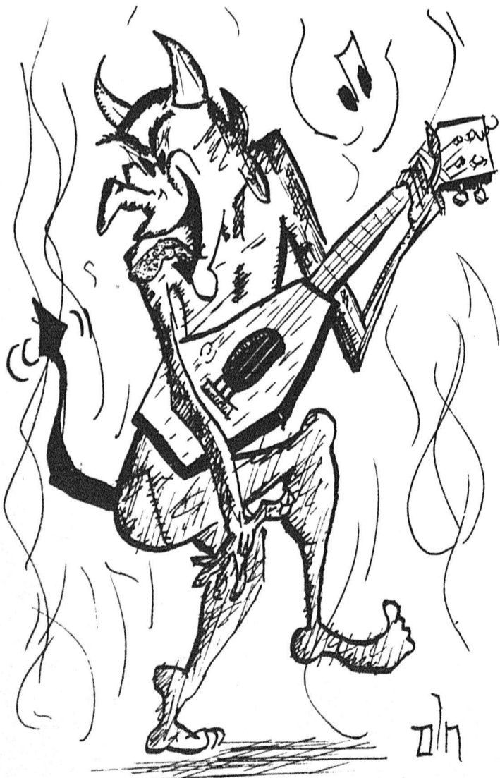
TURN ON, TUNE IN ... and wail, baby, wail