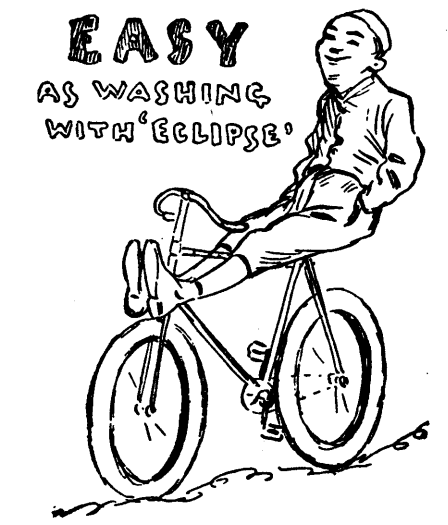
WHO could be happier than this youth? Only those who use ECLIPSE SOAP, not only in their laundry, but for all cleansing purposes. SAVE YOUR WRAPPERS—send us 25 of them for a copy of our celebrated picture "After the Bath."

50c. and $1.00, all druggists. SCOTT & BOWNE, Chemists, Toronto.