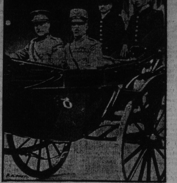
King Albert of Belgium and King Victor Emmanuel of Italy riding to the palace at Rome, on the Belgian ruler's arrival.

The recent trip of King Albert of Belgium to Rome, where he visited Pope Pius XI, has given rise to the rumor that the object of his visit was to arrange the rumored engagement of the crown prince of Belgium to Princess Yolanda of Italy.