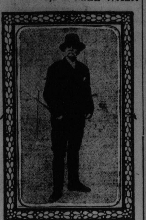
EDWARD PAYSON WESTON