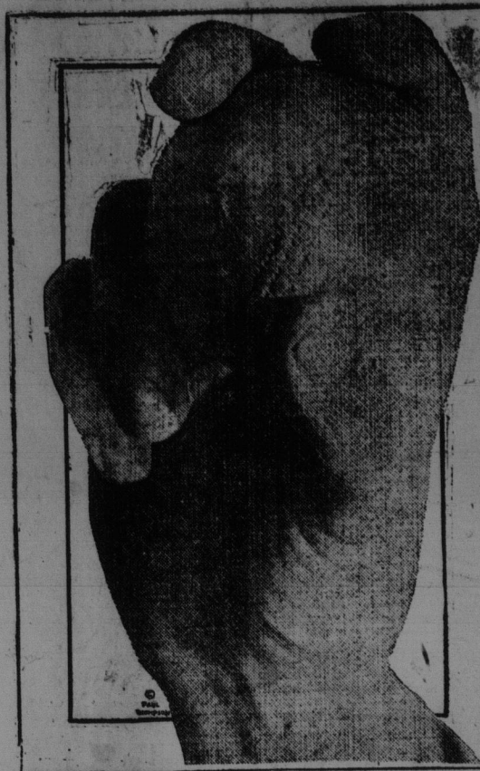
Walter Johnson of the Washington team holds the ball thus. Johnson throws what is known as the invisible ball. It comes in so fast it can't be seen with the naked eye.