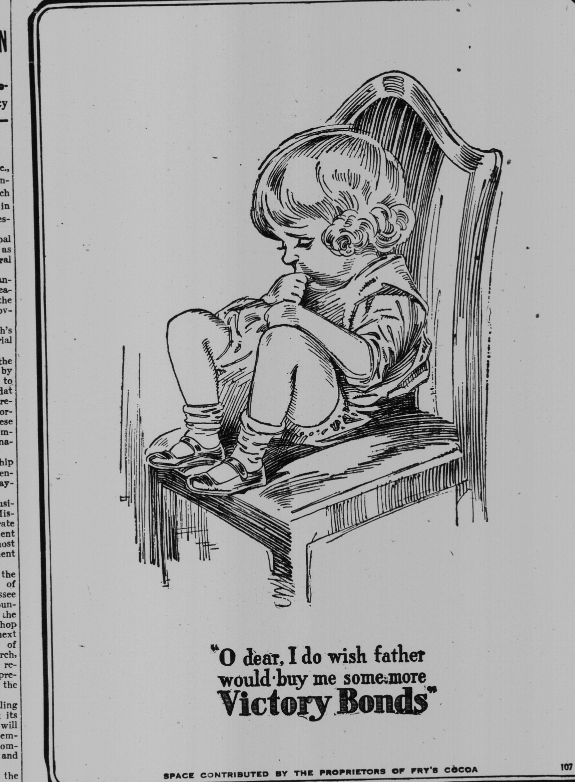
"O dear, I do wish father would buy me some more Victory Bonds"

MURINE'S Bests, Refreshes, Soothes, Keeps Your Eyes Strong and Healthy. If they're Smart, Itchy, Burn, or Sore, Irritated, Inflamed or Granulated, use Murine often. Safe for Infant or Adult. At all Druggists in Canada. Write for Free Eye Book. Munna Company, Chicago, U. S. A.