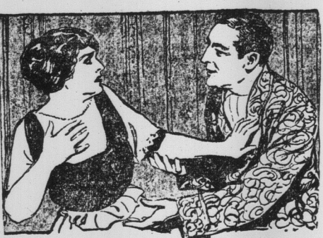
Your Thief—I believe!