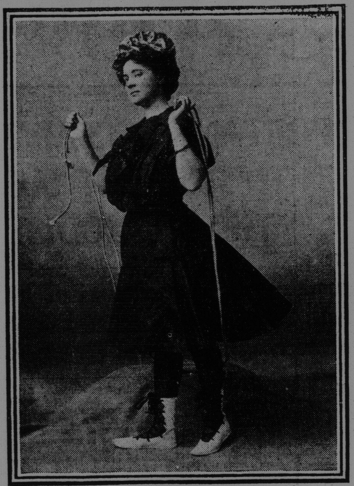
SILKEN BATHING SUITS ARE SHAPELY.

name was, and not so many years ago, when bathing suits were a horror to contemplate. But all that has changed and the woman who studies her appearance first and her health afterward need no longer hesitate to appear on the seashore in bathing garb. Costumes in plain taffetas and fine mohair are in all the dark shades. They have skirts which discreetly cover the knees and fit smoothly about the hips, although by means of shirrings fulness is added wherever necessary. Sailor collars and nautical ties distinguish most of the deeply plaited blouses whose sleeves are short and puffy, the better to display a pretty elbow.