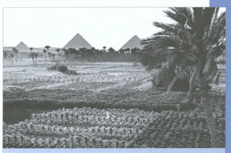
Parts of Egypt are fertile, but it still relies heavily on foreign food imports.

"The economic and social changes, not to mention the large tourist base, have led to an increase in demand for top-quality processed and semi-processed food products.