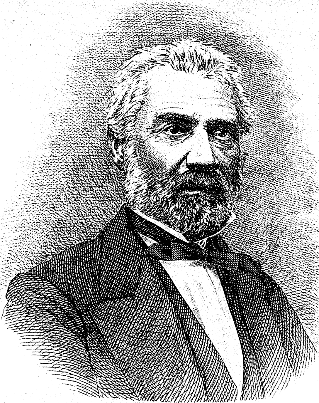
JUDGE ARMSTRONG, RECENTLY APPOINTED FOR THE ISLAND OF ST. LUCIA.—SEE PAGE 338.