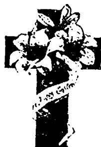
The Copp, Clark Co.

The line of gilt and other crosses is unusually beautiful in both design and finish. Among the more striking of these may be mentioned No. 7068, of which the accompanying illustration gives the general outline. It is a large mauve cross, with a golden star in the centre and a white water-lily at each end. No. 7072 is a gilt flower cross in two styles. No. 7074 is a beautiful gilt cross in two styles. No. 7075 is a beautiful gilt cross showing angelic figures discoursing sacred music. No. 7076, in two styles, is a pretty cross, one style with doors, the other with flowers. No. 7078 is also in two styles. It is plain gilt with angelic faces in the centre of groups of flowers. No. 7081 is a small gilt cross in several styles, and each having different flowers entwining the cross. No. 7084 is a severely plain cross of three pretty flower designs. Space forbids further mention of this handsome line, the beauty of which cannot be adequately described, as it consists in the artistic daintiness of the designs and the extreme delicacy of the colorings.