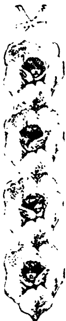
Cross Drop. No. 732—16c. each. Copp, Clark Co.

cross drop called "Easter Hope." The four crosses are entwined with lilies, and the centre of each bears a sweet cherub face.