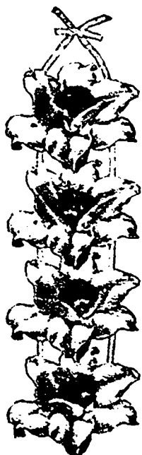
Lily Drop. No. 729—16c. each. Copp, Clark Co., Limited.

Nerlich & Co., Toronto, who are now sending their travelers out for import orders for fancy goods, have a varied and tempting assortment to offer the trade this year. In picture frames and photo stands the variety is large, and includes some of the daintiest novelties that have ever been shown here. The range runs from cheap glass frames to fancily embossed celluloid ones. Albums are shown in plush, leather and celluloid covers. Mirrors range from small hand-glasses to large, fancy triplicate mirrors.