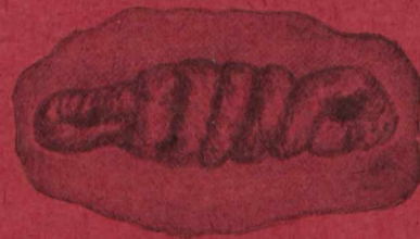
A Strand of Lead Wool coiled up for transit