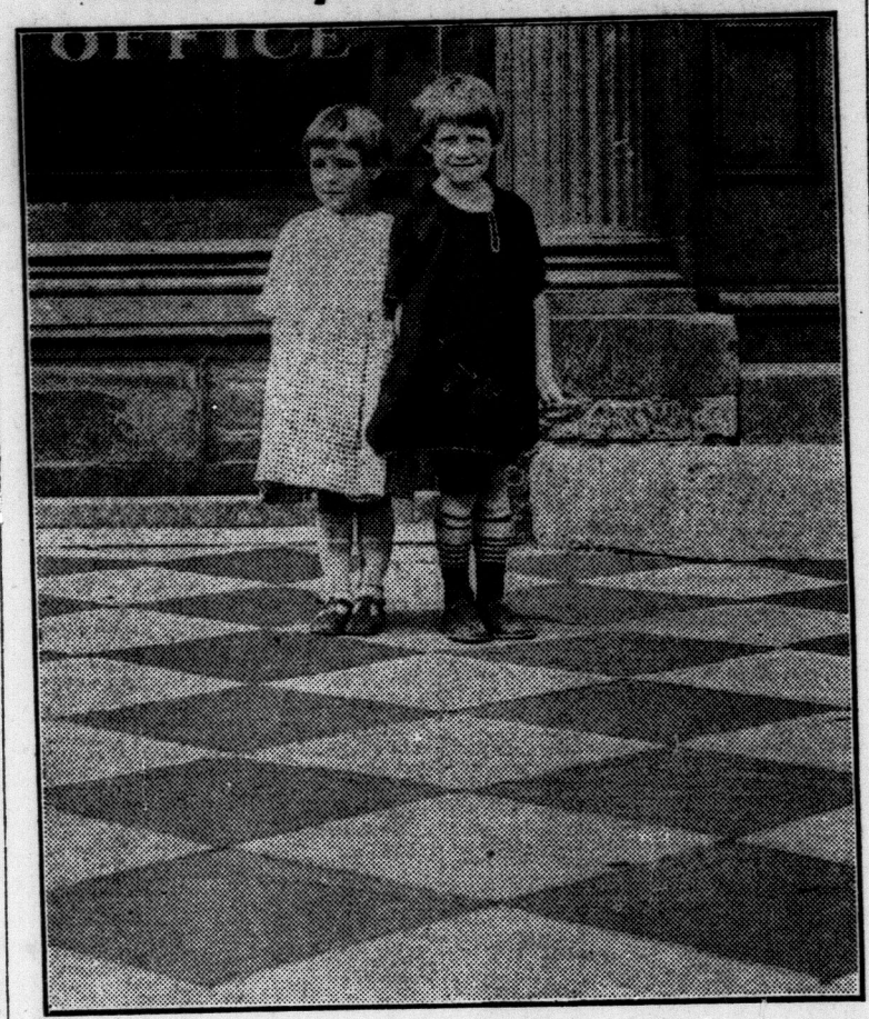
Sidewalk Laid As Experiment in 1899 Has Been Source of Never-Ending Wonder and Delight to Old and Young Folks at the City Hall.