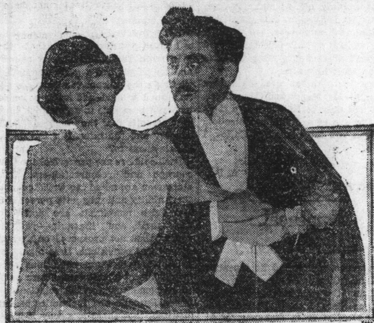
SESSUE HAYAKAWA in "The White Man's Law." A Paramount Picture