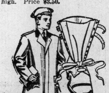
Boys Storm Shoes

inches high. Price $5.50. Men's 12 inches high, full Bellows Tongue to top. Price $4.50. Men's 10 inches high. Price $4.00. Men's 8 inches Price $4.00. Men's 8 inches high. Price $3.50.