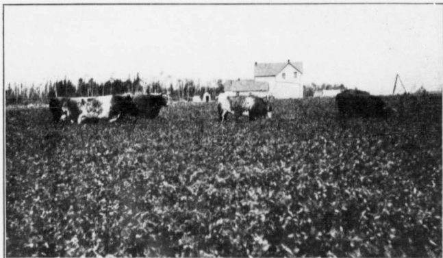
Cows in pasture.

too much stock for which they have to buy feed, at exorbitant prices. This very soon reduces the amount of cash capital on hand and does not bring sufficiently large returns to warrant such expenditure.