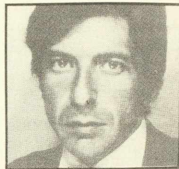
Leonard Cohen doesn't look like this anymore

In Sincerely, a Friend , outcasts hold court dressed as caricatures that bring to mind the players in the film Cabaret . Indeed, the biggest crowd pleaser opening night was an effeminate and high-heeled